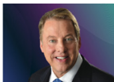
William Clay Ford, Jr. Executive Chair, Ford Motor Company