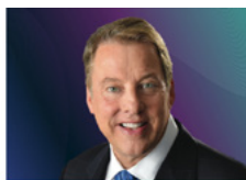
William Clay Ford, Jr. Executive Chair, Ford Motor Company